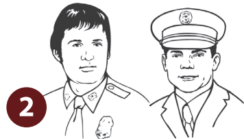
2 Spokane County Law Enforcement & Firefighters